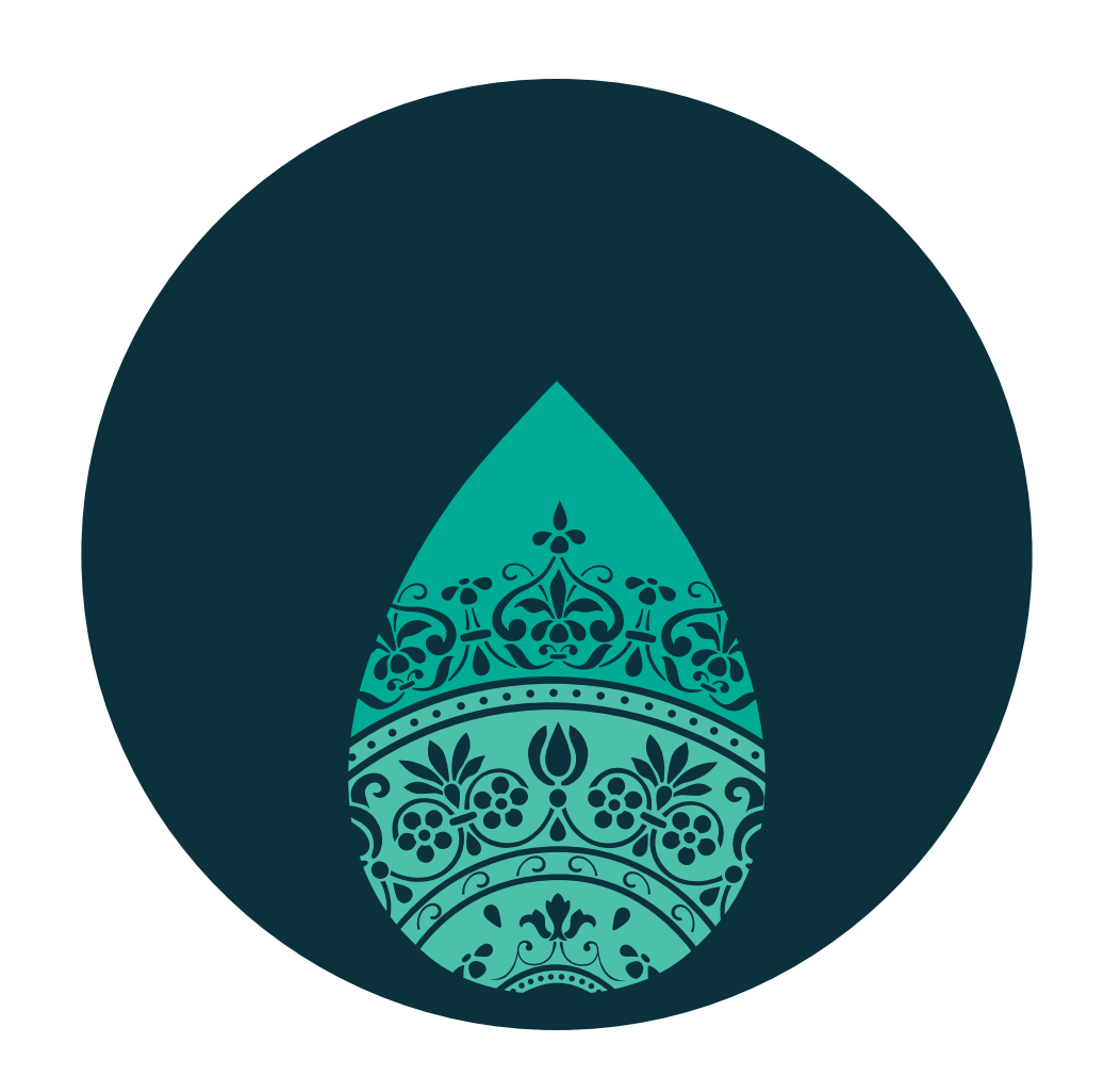
Prepared for Sadhana Health, Inc by the Curio Museum