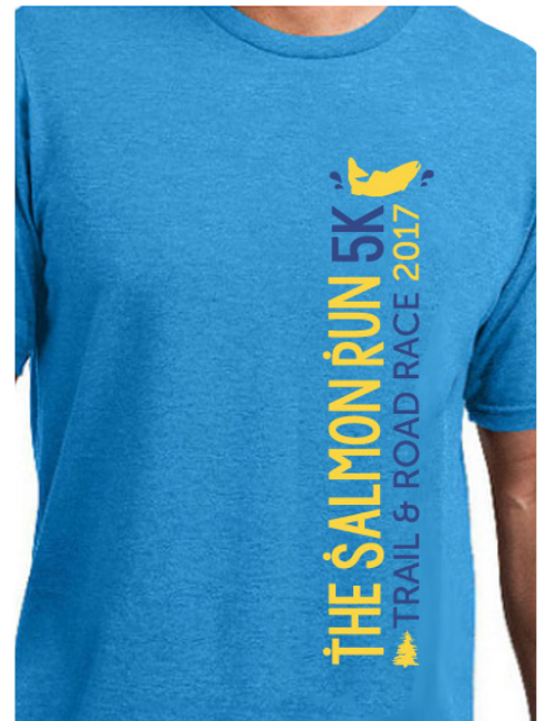
SALMON RUN • 2017