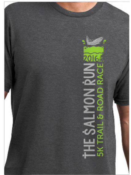
SALMON RUN • 2016